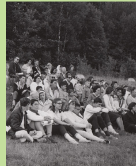
Biluim Canada 1964 Visitors Day