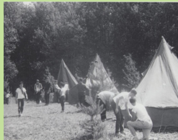
Camp Solelim 1966