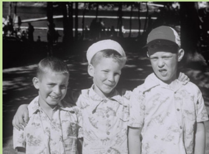
Camp Kadimah 1950

Highlighting Canadian Young Judaea National from 1950-1969