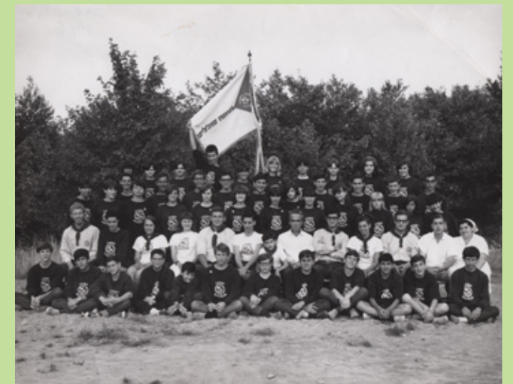
Camp Solelim 1966