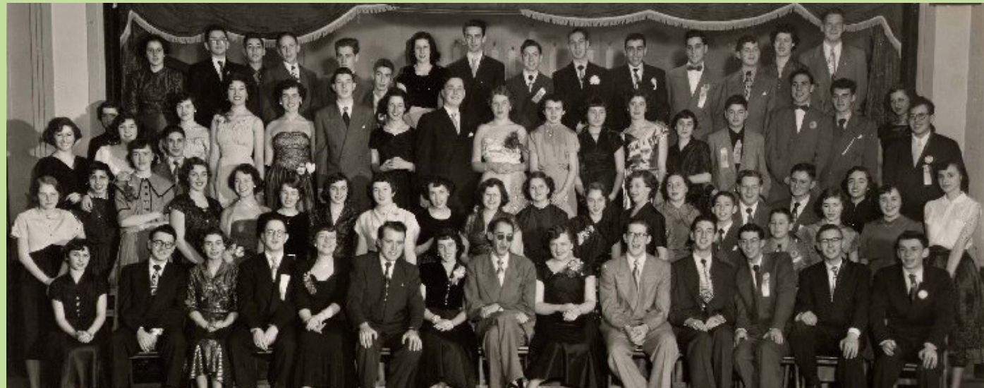
Maritime YJ Conf. Saint John 1950